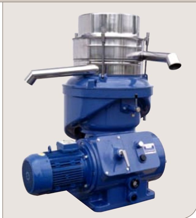
UVPX 507 complete with motor

These include the Combimatic system, which makes it possible to pre-set an automatic discharge cycle with preventive oil ejection and automatic discharge of solids